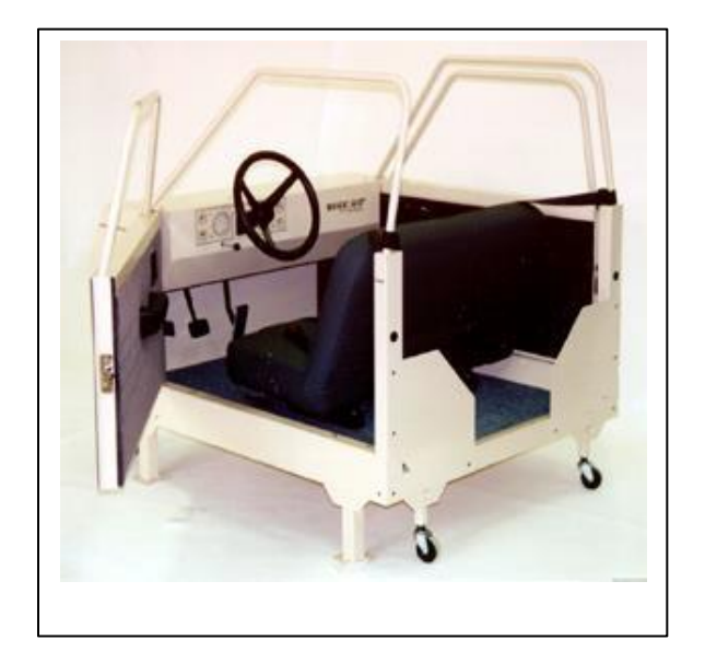
Model WT-960 TRAN-SIT® Car Transfer Simulator shown above with optional components